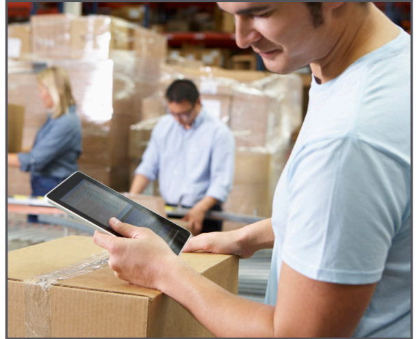
Ivanti TE is the only Terminal Emulation client recommended by leading supply chain management application providers.

They also don't need to worry about software compatibility. Ivanti TE is the only Terminal Emulation client recognized and recommended by the world's leading supply chain management application