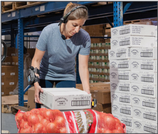
Ivanti TE is the only Terminal Emulation client recommended by leading supply chain management application providers.

Ivanti continues to invest in Terminal Emulation. The Ivanti TE portfolio now spans all the leading mobile operating systems—from Windows Mobile and CE to Android and iOS. Yet the innovation doesn’t stop with OS compatibility. Recent enhancements to Ivanti TE include support for double-byte characters on the TE for Android client, making Ivanti TE more readily accessible for deployments in Asia. What’s more, XML-based keyboard editing has been added recently to the Android client for greater keyboard customization capability—adapting to specific workflows.