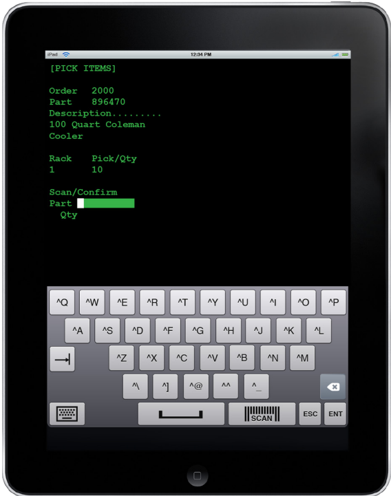
Ivanti continues to invest in TE, offering clients for Android and iOS (shown above on iPad).

At first glance, Terminal Emulation doesn’t look like a 21st-century mobile application. Its “green screen” appearance looks like a software utility from the DOS platform days. Although it originated there, Ivanti TE has evolved alongside the mobile operating systems that have brought enterprise mobility to the present day.