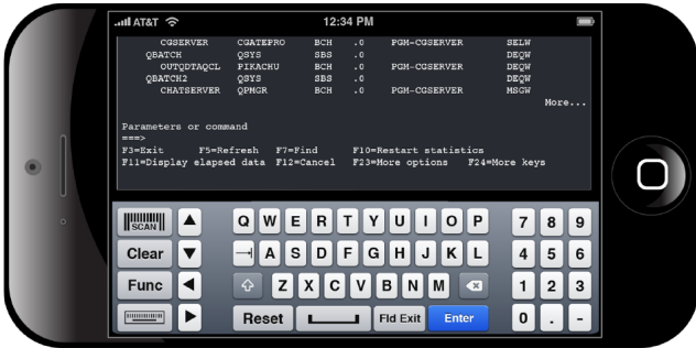
What has been constant for task workers is the simple, familiar look of Terminal Emulation (shown here on iOS)

For companies that have already deployed enterprise mobility solutions, TE reduces the learning curve when upgrading hardware. Task workers have watched mission-critical enterprise mobility hardware come and go over the years, but what has been constant is the simple, familiar look of Terminal Emulation. Workers have had to adjust to new features—hardware changes from monochrome display to color, DOS to iOS, navigation, input methods, and more. Yet through it all, sticking with